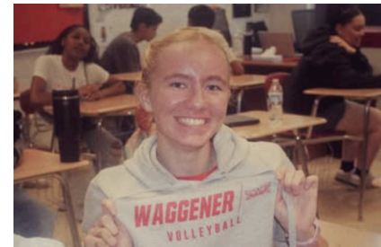
Showin' some pride in the Red & Gray